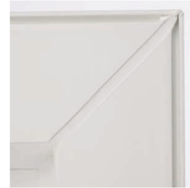
Clean, detailed welded corners