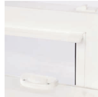
Tilt latches and locks