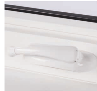
High quality hardware